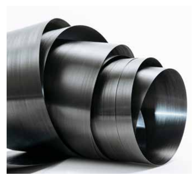
Unidirectional continuous fiber reinforced thermoplastic tape (UD tape).

Digital twins of individual machines and systems already lead to significant increases in efficiency in industrial production and continuous operation, e.g. through improved production control and machine maintenance. However, their potential for value-added and material-triggered process control is still largely untapped. This applies in particular to the increasing series production of plastic-based composite lightweight structures.